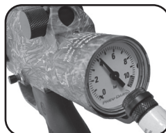
X-2 Gauged Co2 Pistol