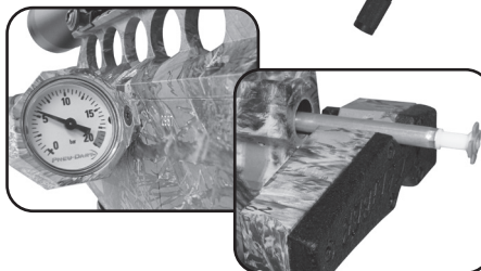
G2 X-Caliber Gauged Co2 Rifle